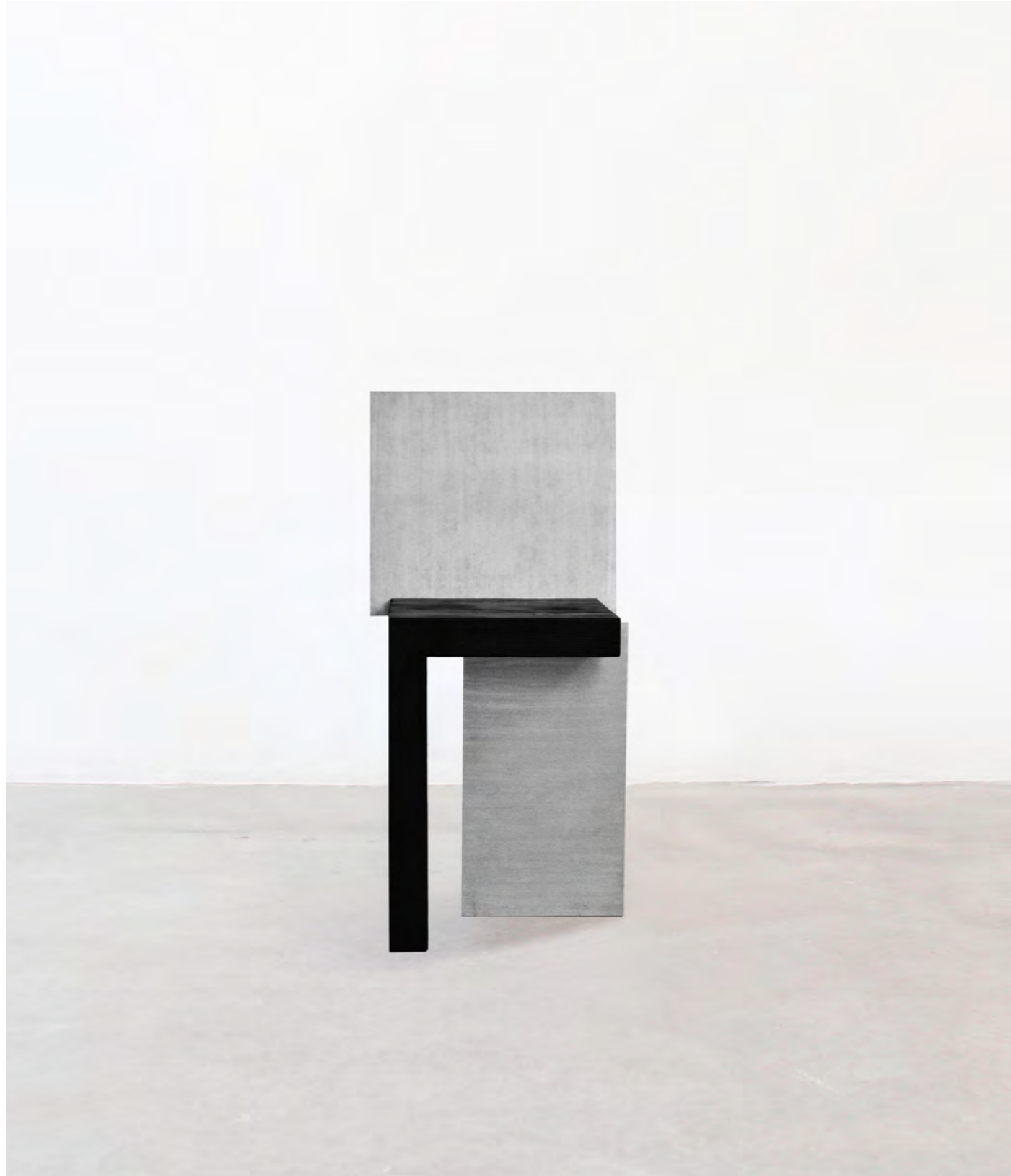
STUDIO LA CUBE • COMPOSITION SERIES CHAIR