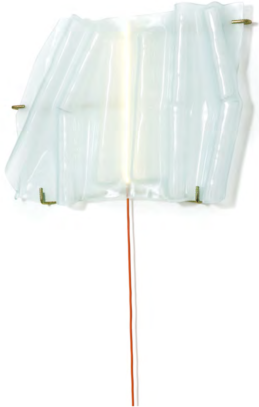
PAOLO GONZATO • BARACCHE HINT OF MINT WALL LAMP