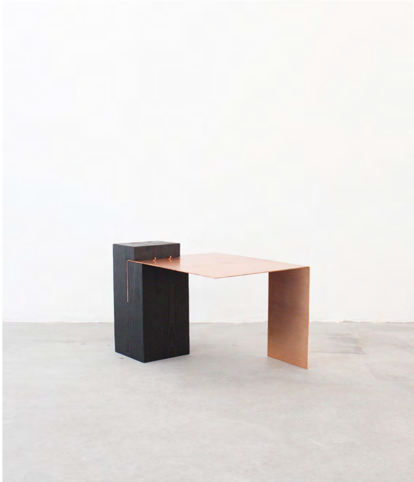
STUDIO LA CUBE • COMPOSITION SERIES SIDE TABLE