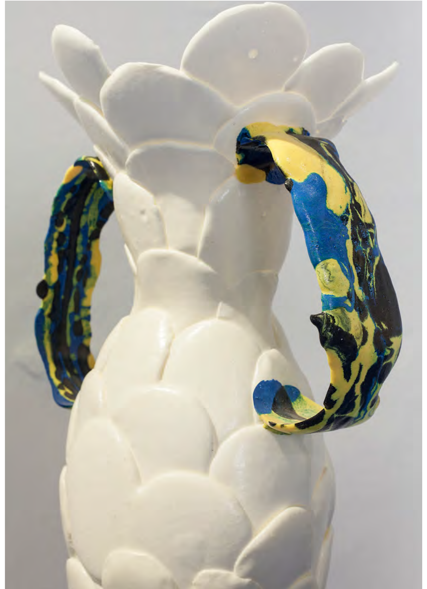
MATTEO PELLEGRINO • @ WHITE VASE 2017 POLYURETHANE FOAM/RESIN H53 L15 W30 CM UNIQUE PIECE