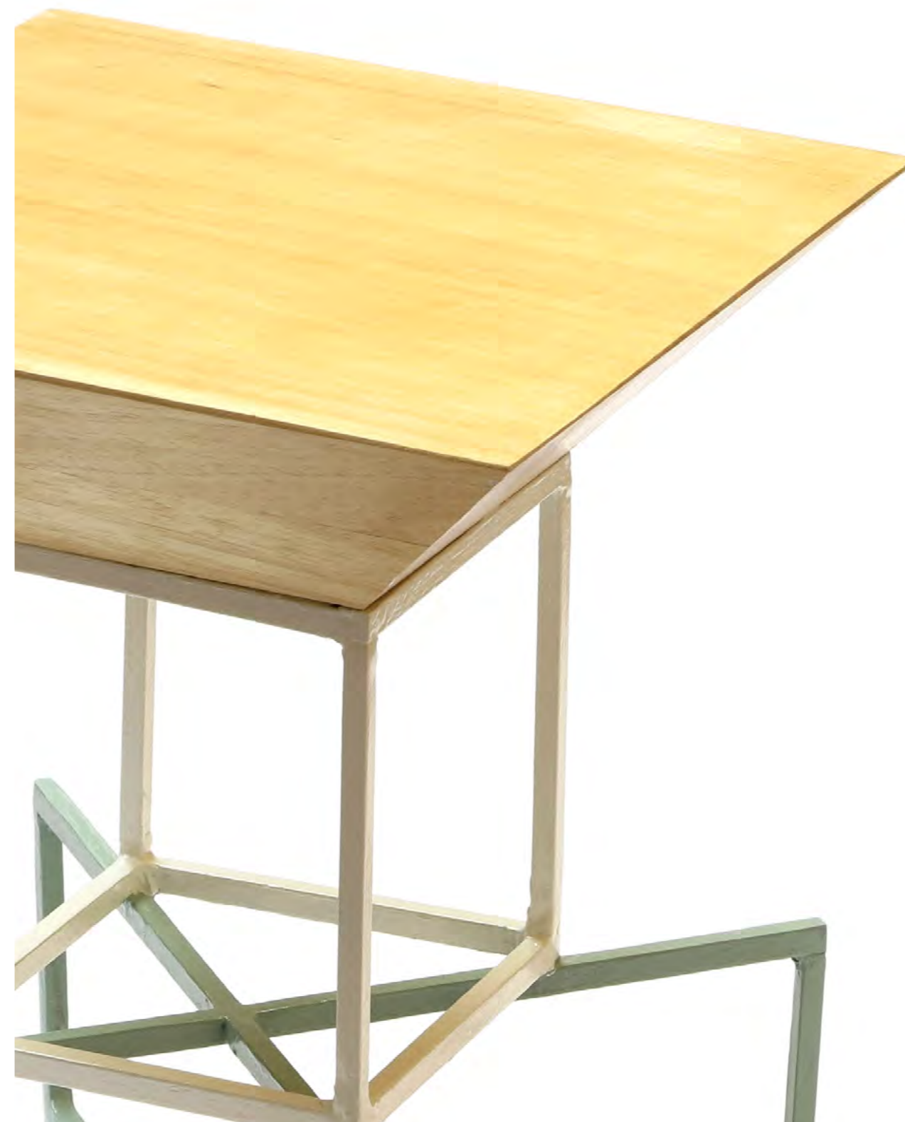
UFFICIO TECNICO • UT#1 SIDE TABEL 2017 SQUARE TUBES ( IRON PAINTED), AYOUS WOOD H49 L47 W47 CM PROTOTYPE