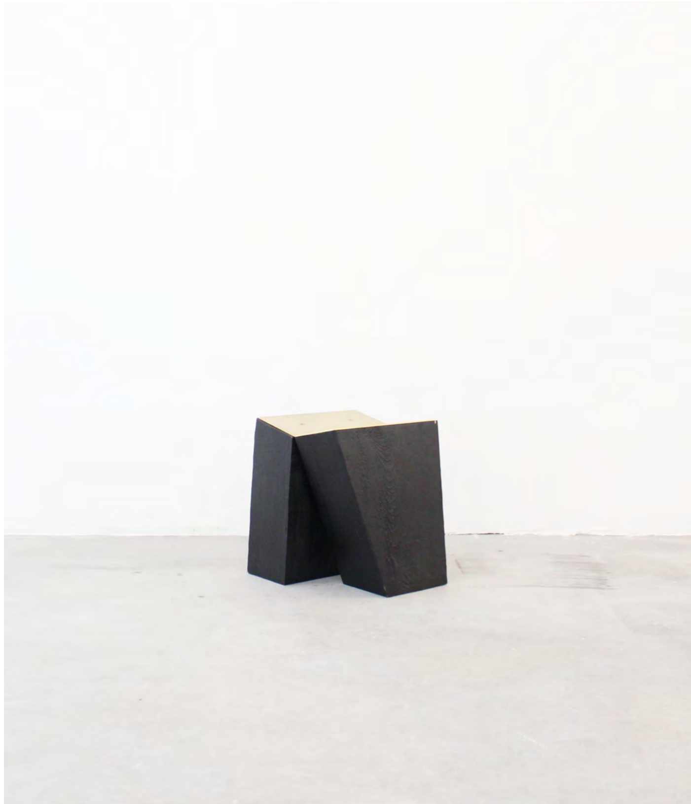
STUDIO LA CUBE • COMPOSITION SERIES STOOL