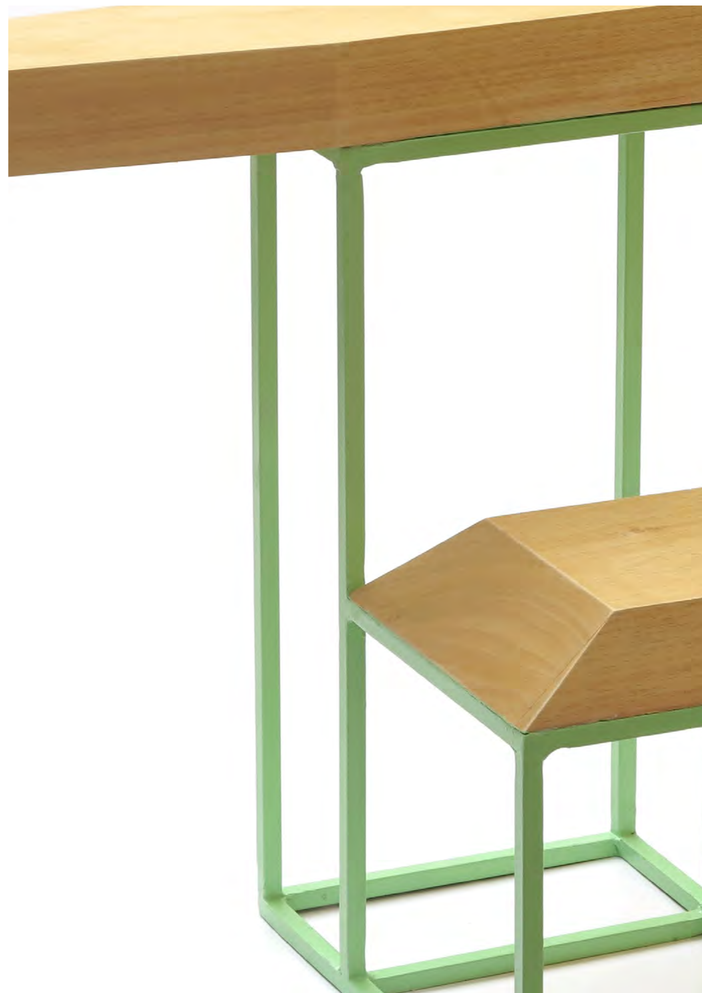
UFFICIO TECNICO • UT#3 BENCH-KNEELER 2017 SQUARE TUBES ( IRON PAINTED), AYOUS WOOD H58 L38 W65 CM PROTOTYPE