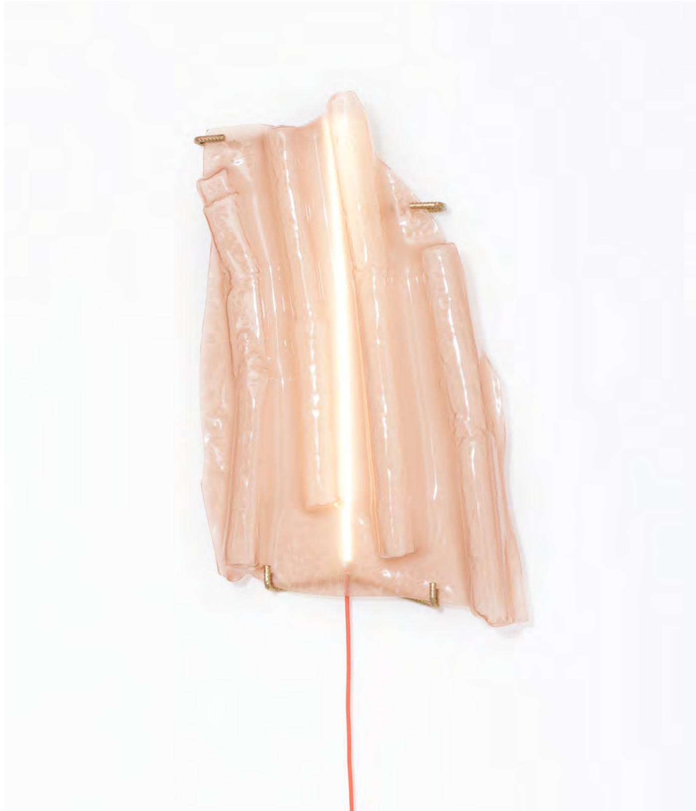
PAOLO GONZATO • BARACCHE PINK WALL LAMP 2016 FLOAT GLASS, TROPICALIZED IRON, LED H58 L51 W10 CM UNIQUE PIECE