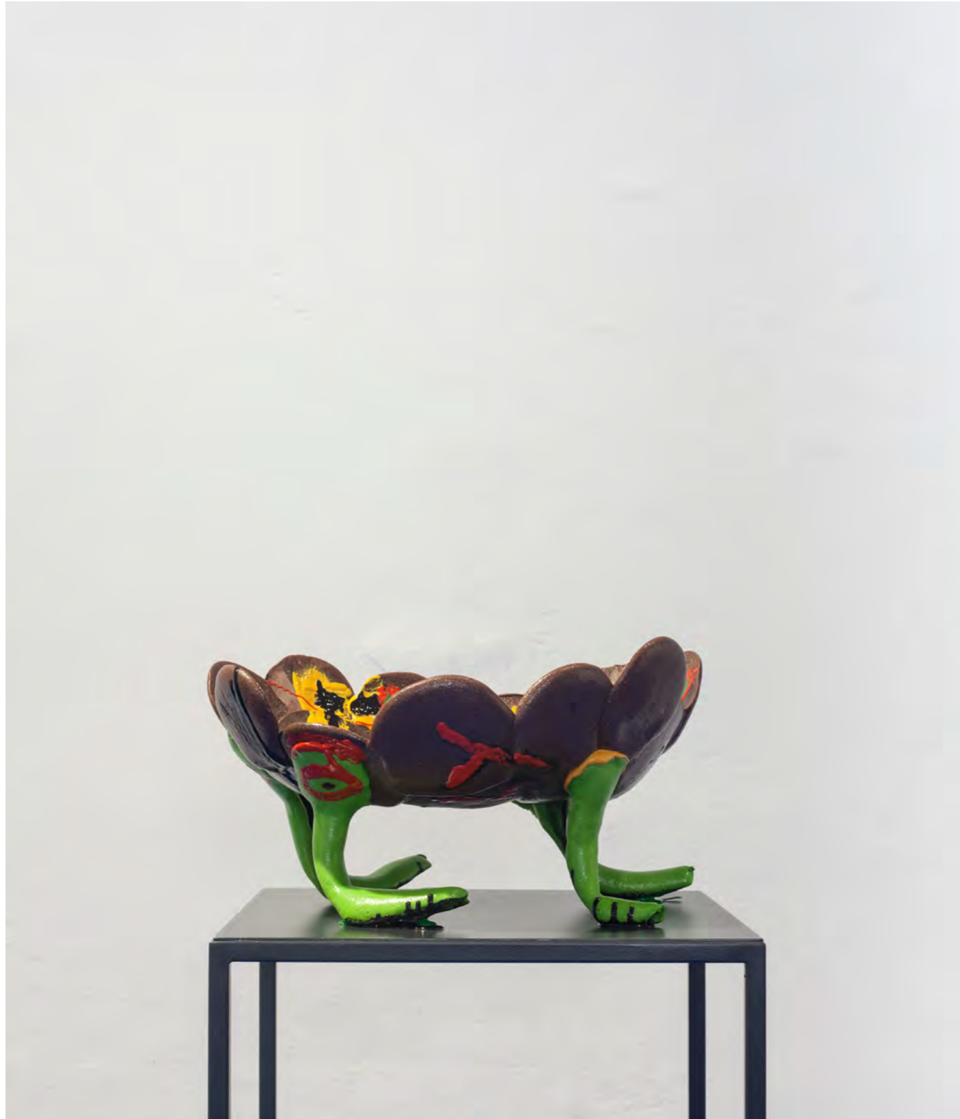
MATTEO PELLEGRINO • @ DOG VASE 2017 POLYURETHANE FOAM/RESIN H23 L37 W41 CM UNIQUE PIECE