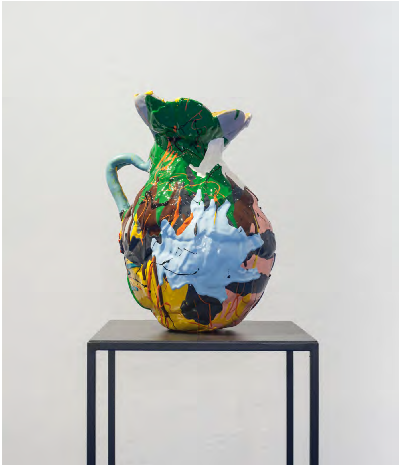
MATTEO PELLEGRINO • @ COLORED VASE