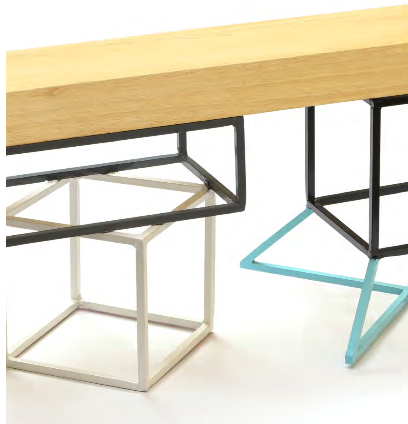
UFFICIO TECNICO • UT#2 BENCH 2017 SQUARE TUBES ( IRON PAINTED), AYOUS WOOD H43 L100 W40 CM PROTOTYPE