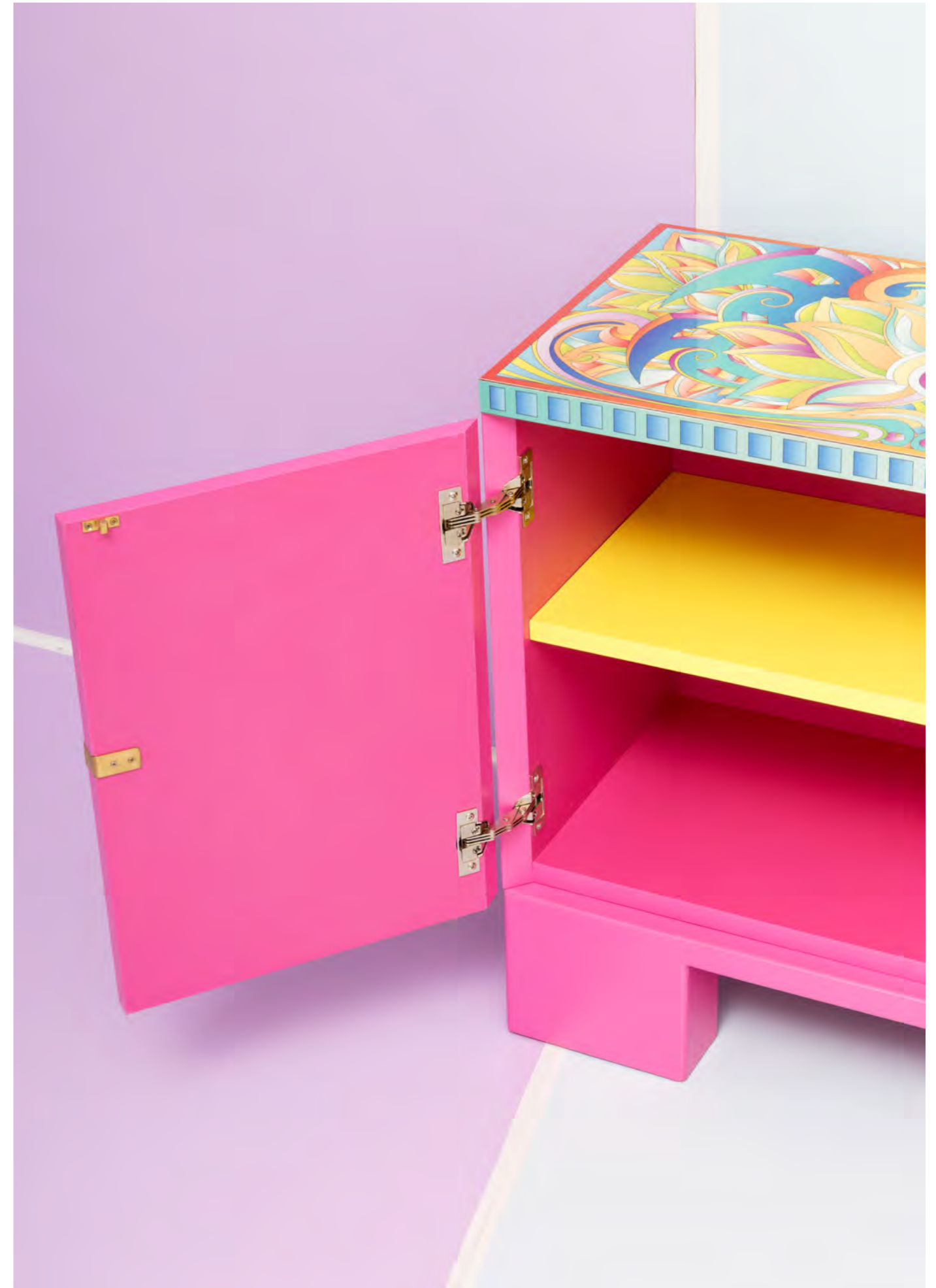
ADAM NATHANIEL FURMAN • ANGIOLO SIDE UNIT 2017 MDF, LACQUERED METAL, LAMINATES SPONSORED BY ABET LAMINATI H66 L71 W35 CM UNIQUE PIECE