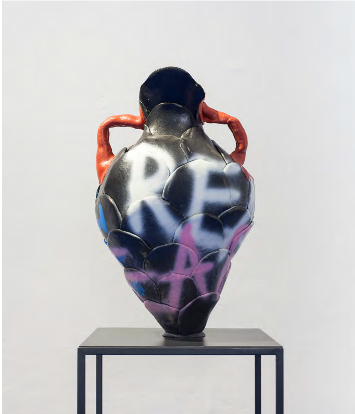
MATTEO PELLEGRINO • @ BLACK VASE 2017 POLYURETHANE FOAM/RESIN H60 L24 W40 CM UNIQUE PIECE