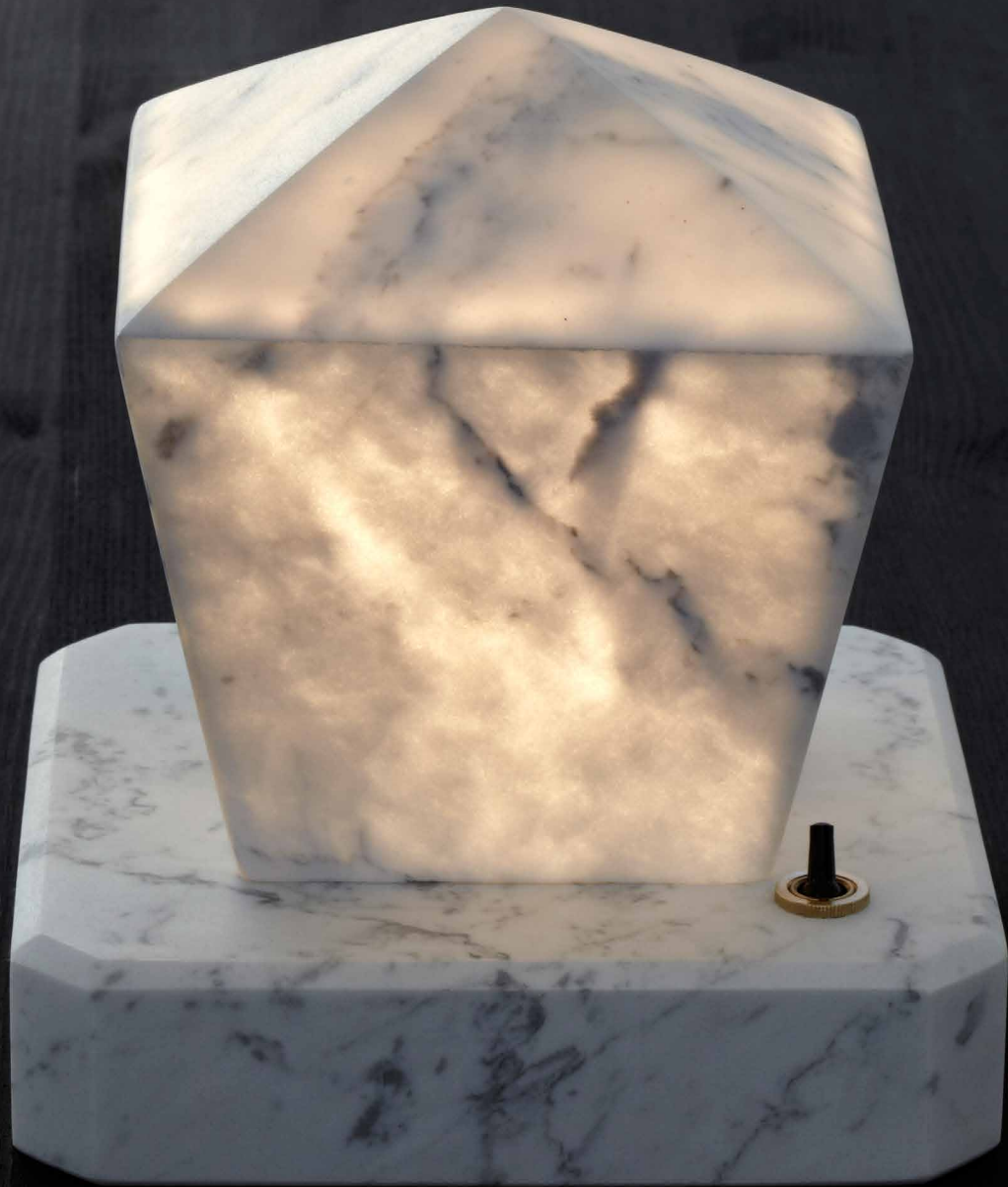
TABLE LAMP, 2015